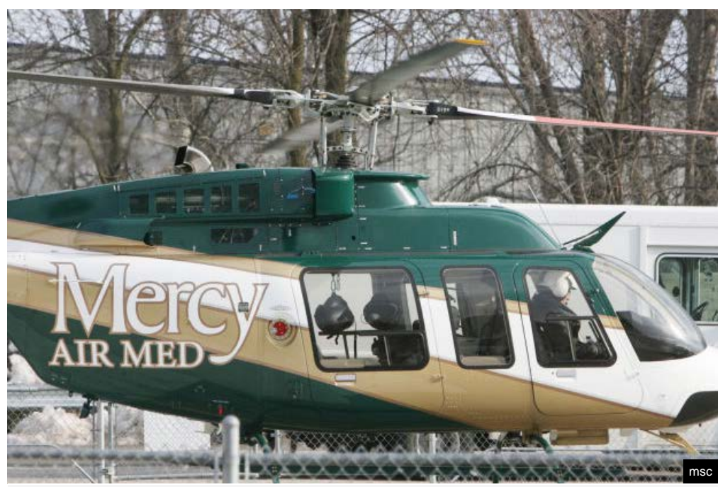
The new Mercy Air Med helicopter lands at a secondary helipad near Mercy Medical Center-North Iowa on Friday.